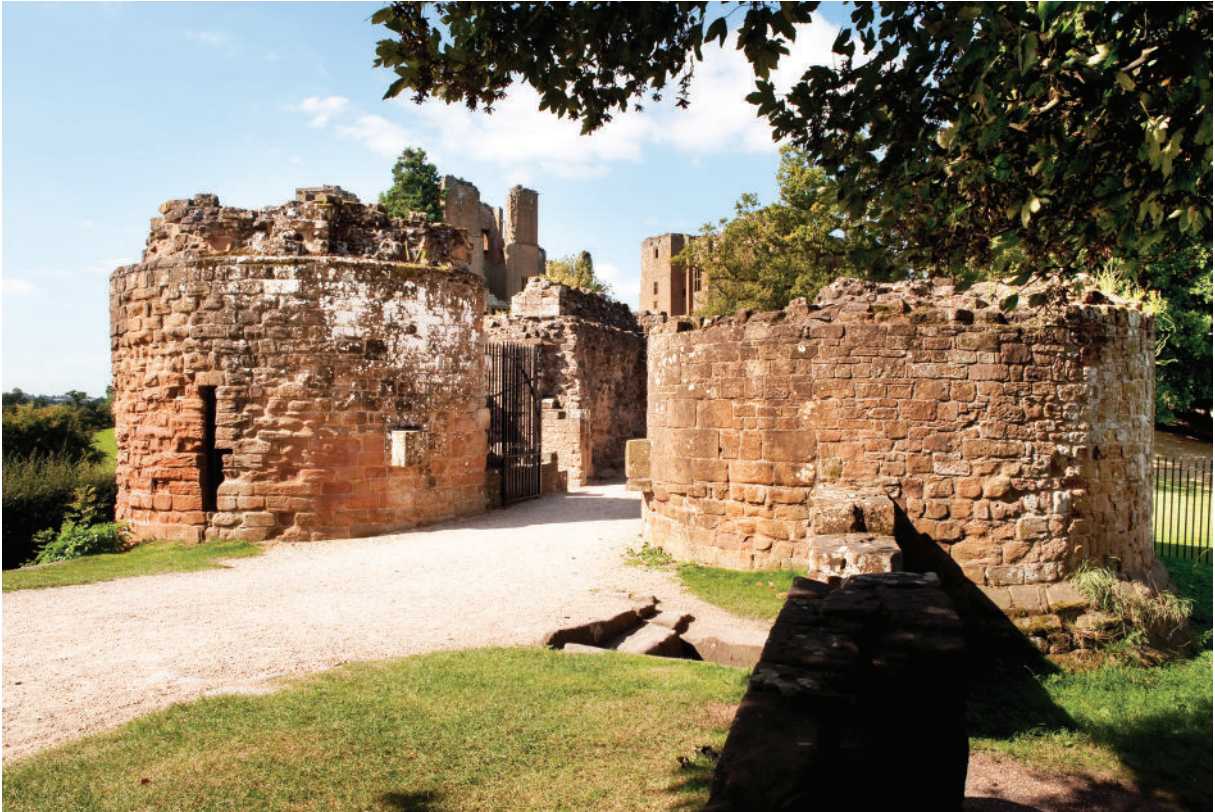
A recent photograph of the remains of Mortimer's Tower, the main gatehouse to Kenilworth Castle, which was built in King John's reign.