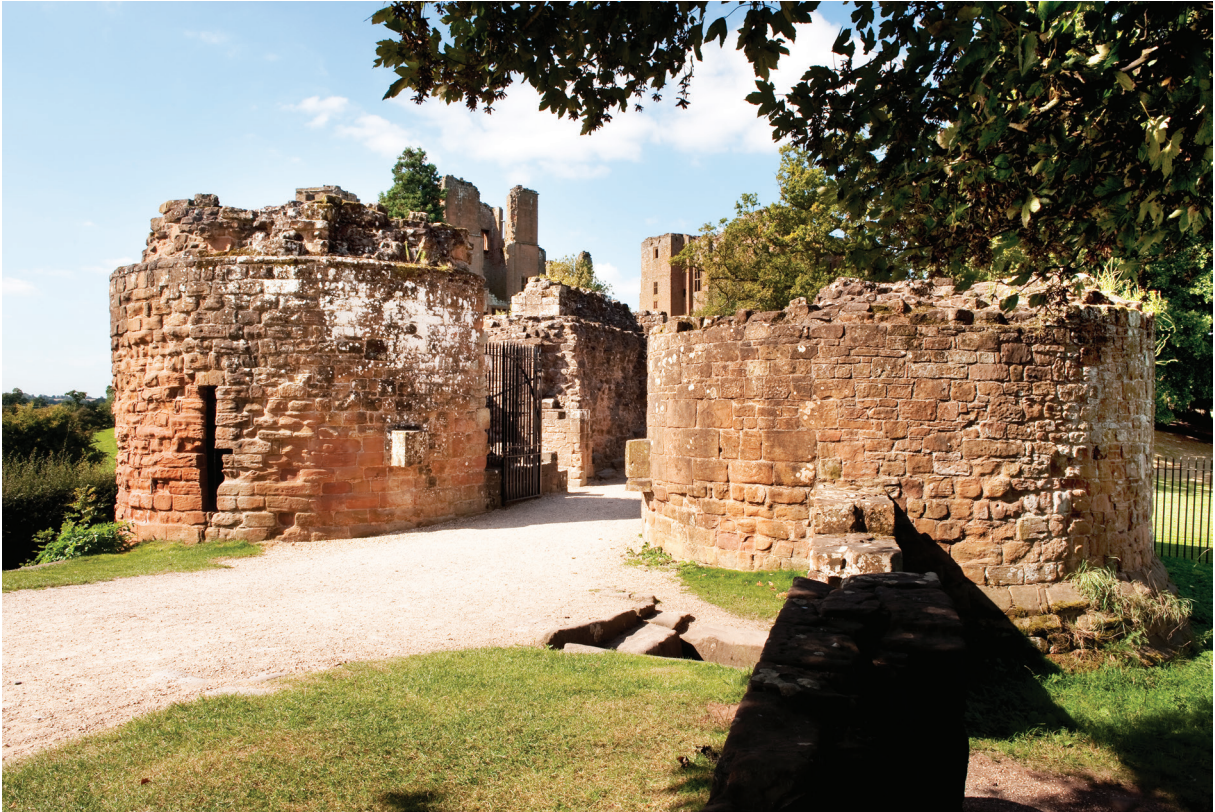
A recent photograph of the remains of Mortimer's Tower, the main gatehouse to Kenilworth Castle, which was built in King John's reign.