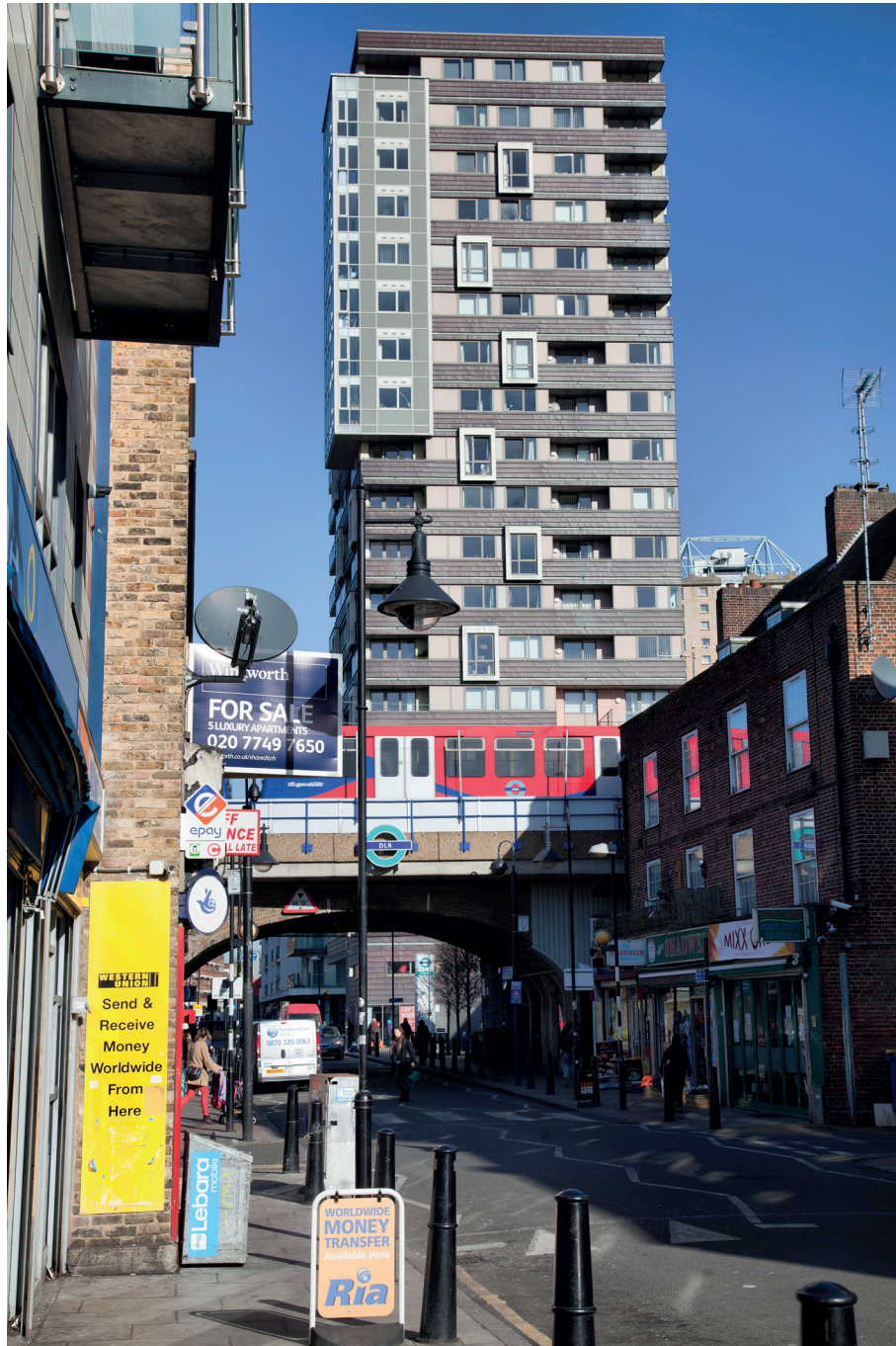
Fig. 1 – Shadwell, an inner city area in east London